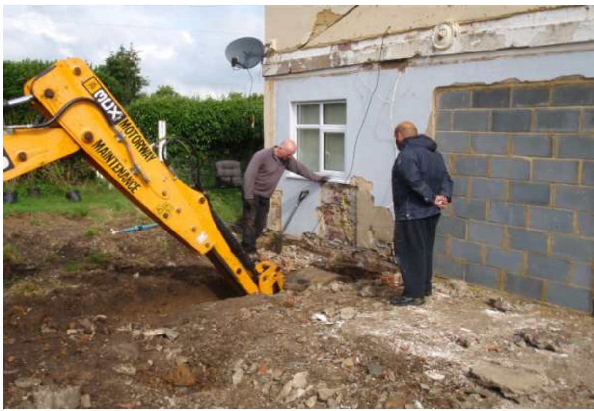
Plate 2. General view of site showing demolished extension (looking north- west)