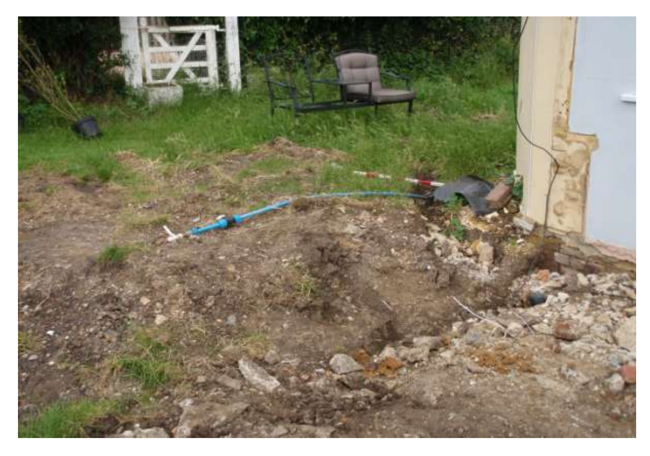
Plate 3. View of existing services