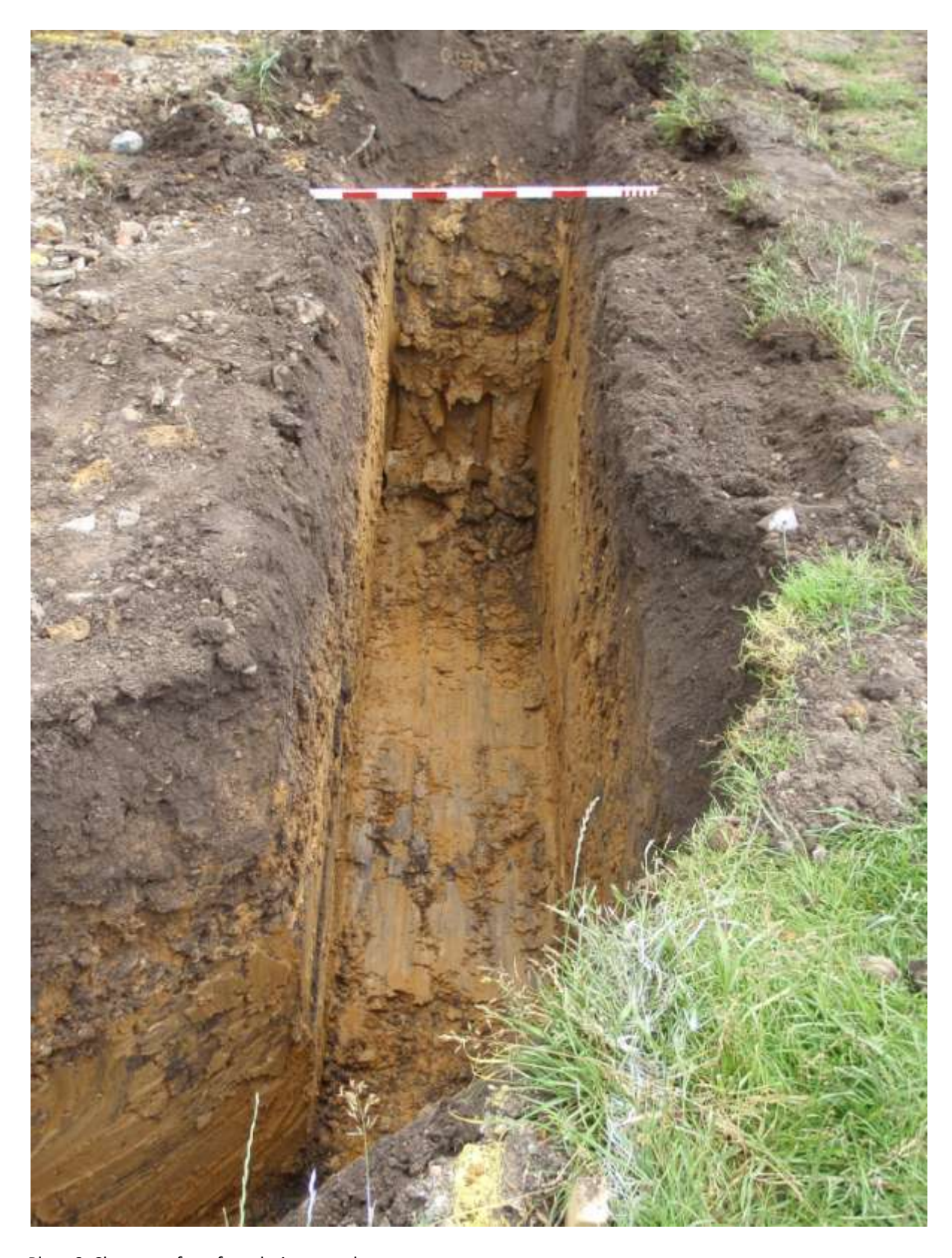
Plate 6. Close up of cut foundation trenches