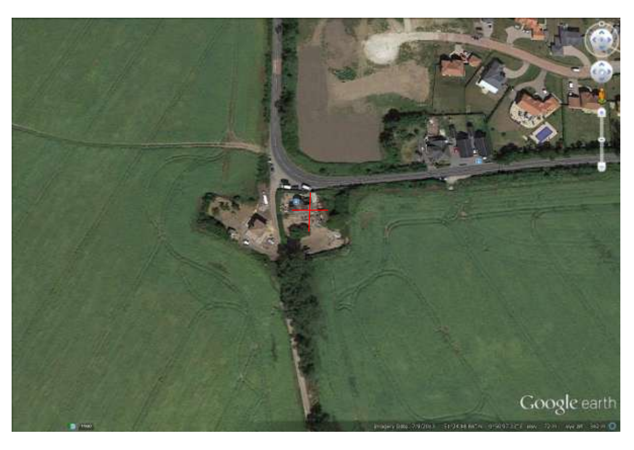
Plate 1. Aerial view of site (red target) showing the site prior to development.

(Google Earth 09/07/2013: Eye altitude 342m).