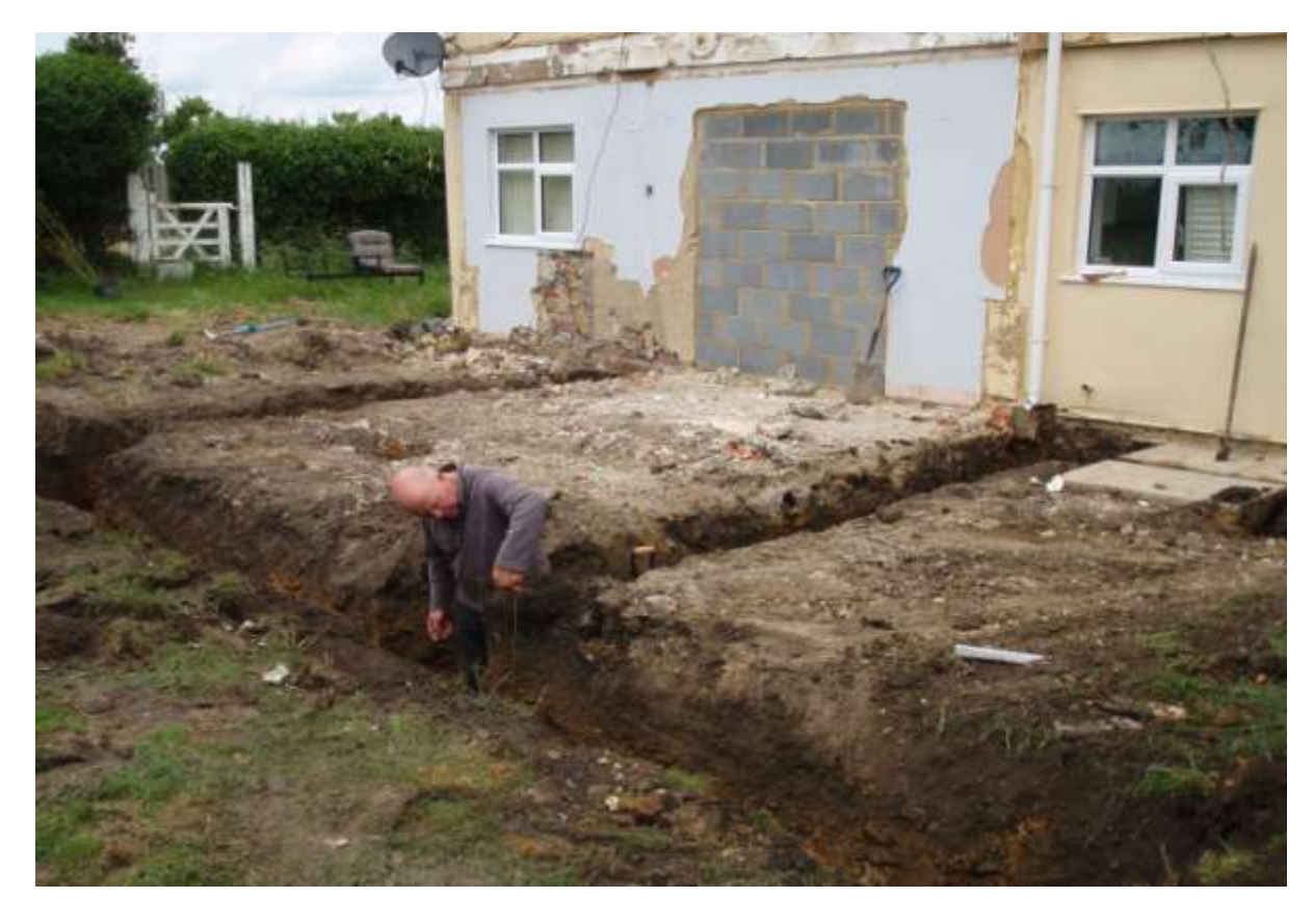
Plate 7. View of completed foundation trenches (looking north-west)