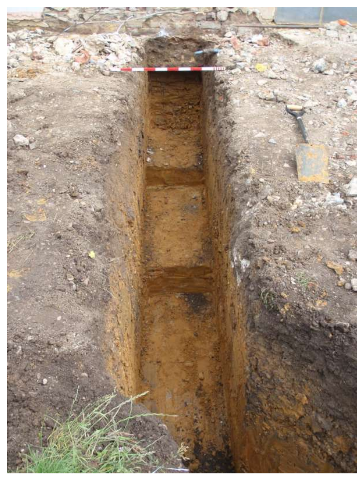
Plate 4. View of stepped foundation trench on the west side (looking north)