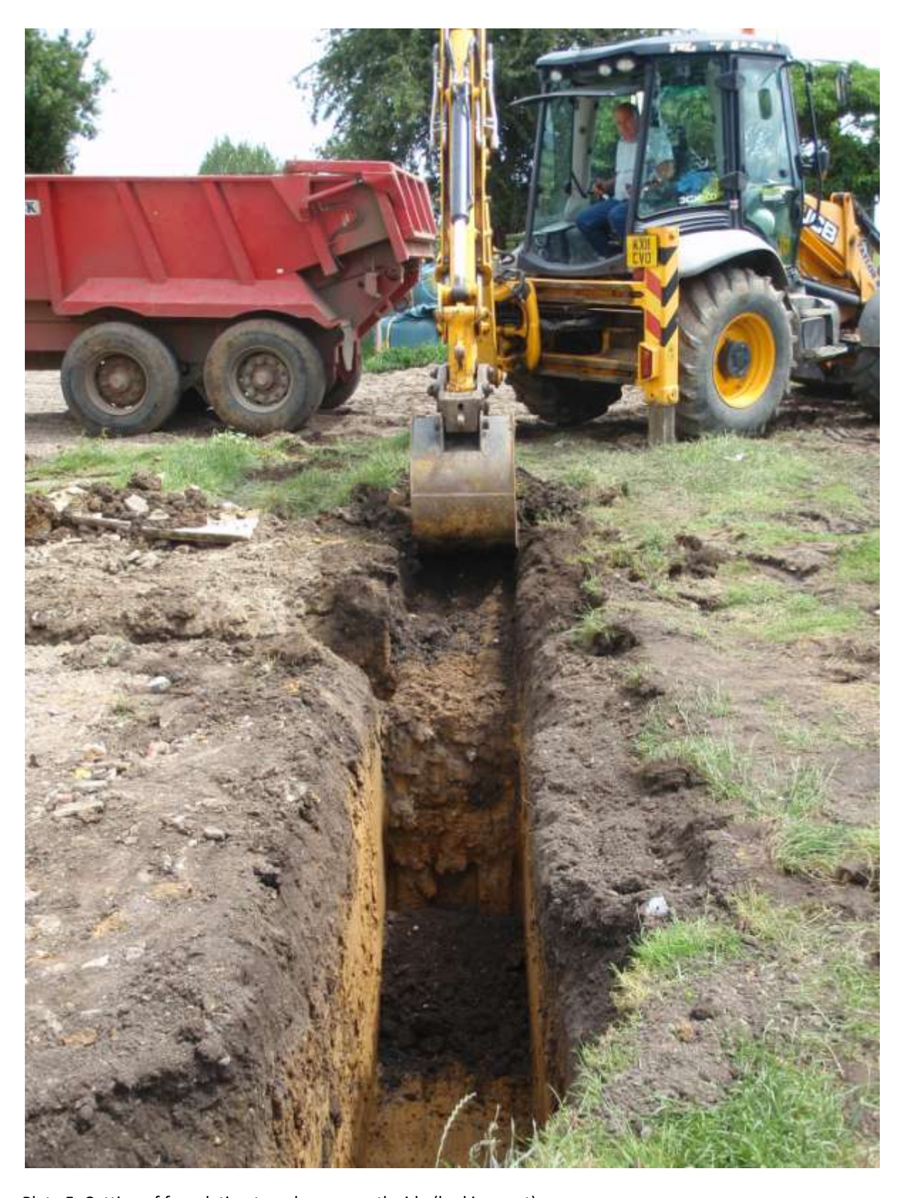
Plate 5. Cutting of foundation trenches on south side (looking east)