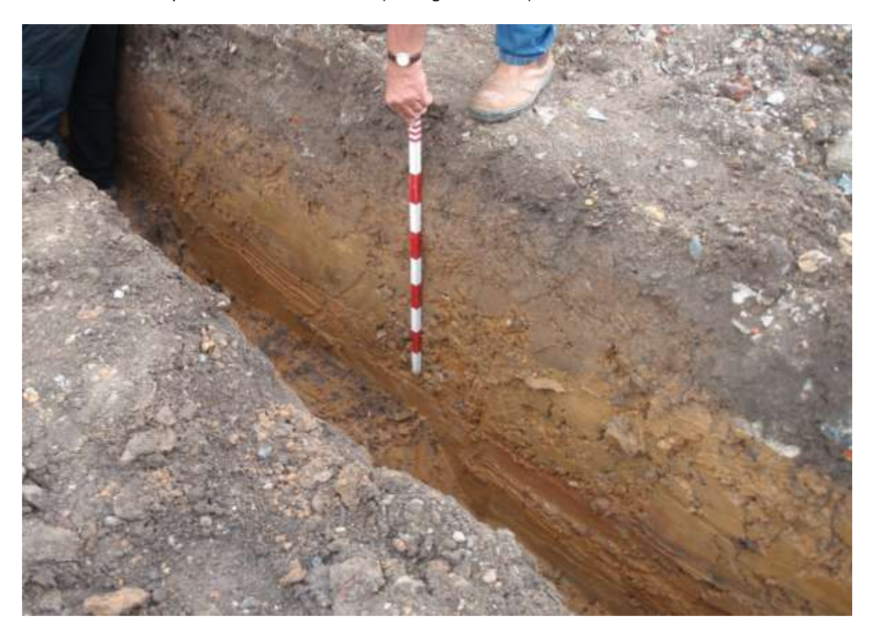
Plate 8. View of section